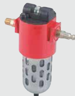
Air filtration kit