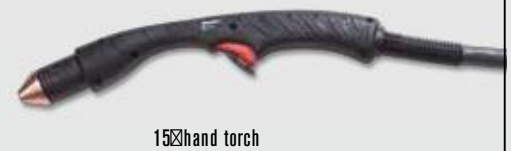
15 hand torch