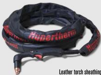
Leather torch sheathing