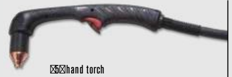
6 hand torch

For more torch options see www.hypertherm.com