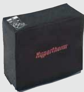
System dust cover